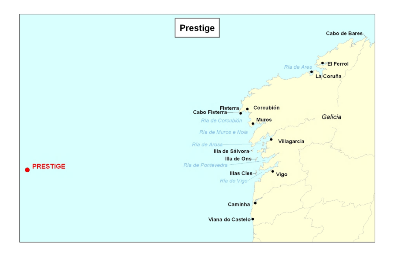
FIGURE 2. PRESTIGE sinking location off Galician coast, Spain.

the Atlantic Islands or the Galician seafood industry, including damage to market confidence.